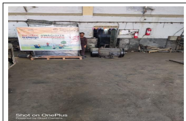
After Cleanliness Drive – Several places in Kolihan Copper Mines of KCC Unit