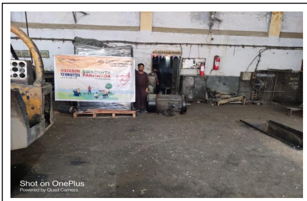
Before Cleanliness Drive – Several places in Kolihan Copper Mines of KCC Unit