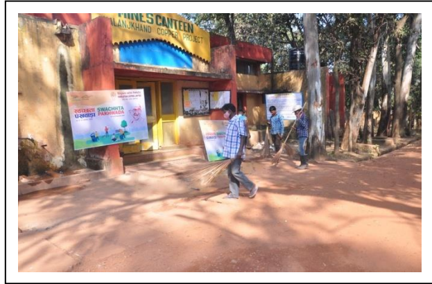
After Cleanliness Drive – Mines Canteen Area of MCP Unit