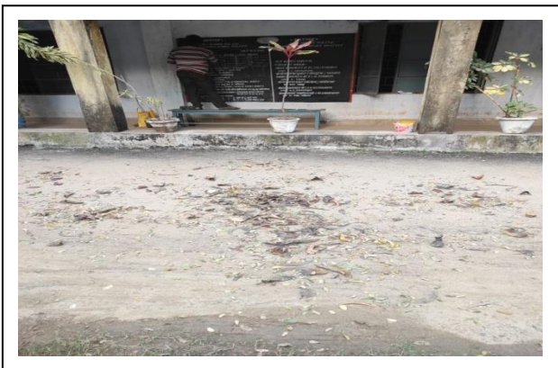
Before Cleanliness Drive – Kendadih Mine Office of ICC Unit