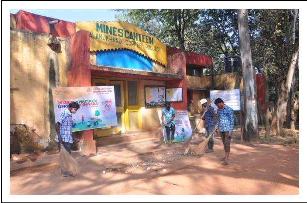
Cleanliness Drive – Mines Canteen Area of MCP Unit