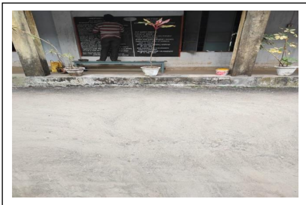
After Cleanliness Drive – Kendadih Mine Office of ICC Unit