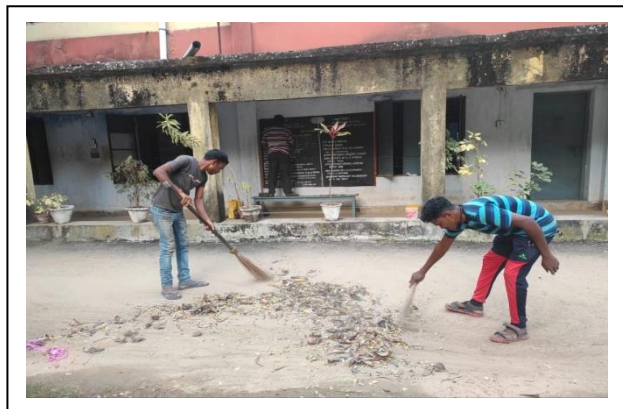
Cleanliness Drive – Kendadih Mine Office of ICC Unit