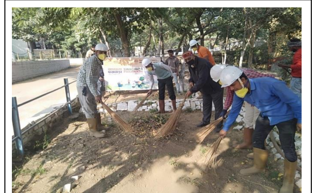
Cleanliness Drive –Near Mine Area of KCC Unit