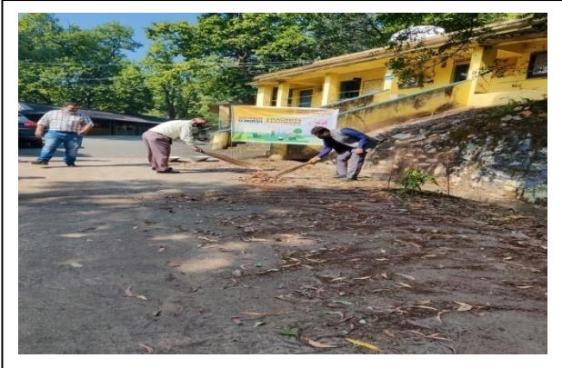
Cleanliness Drive –Outside Surda Mine 3 Shaft Area of ICC Unit