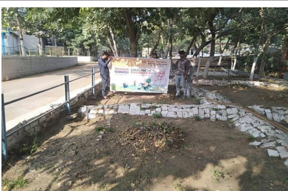
Before Cleanliness Drive –Near Mine Area of KCC Unit