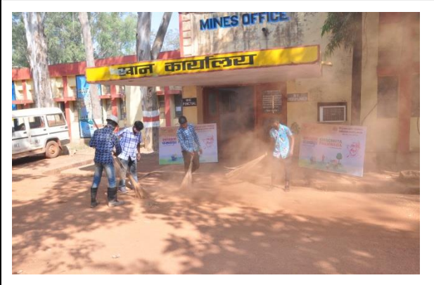
Cleanliness Drive – Outside Mines Office of MCP Unit