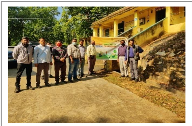
After Cleanliness Drive –Outside Surda Mine 3 Shaft Area of ICC Unit