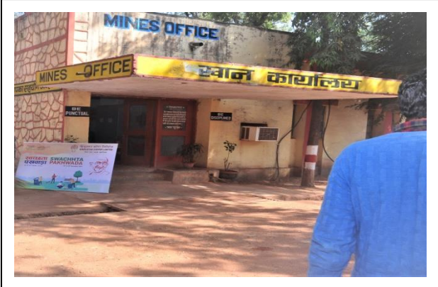
After Cleanliness Drive – Outside Mines Office of MCP Unit