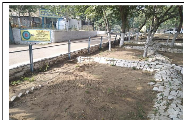
After Cleanliness Drive –Near Mine Area of KCC Unit